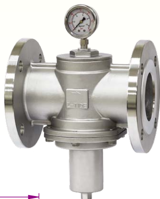
Model : REF ( Flange )