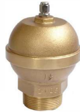
I Style Water Hammer Arrester