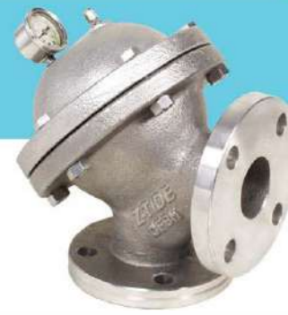
L Style Water Hammer Arrester