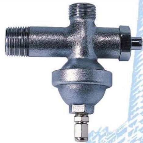
Angle Valve Water Hammer Arrester